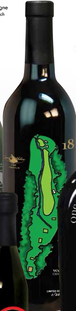
750 ml Cabernet Sauvignon Signature Golf Hole

2010 COUNSELOR® PRODUCT DESIGN AWARD WINNER Awards Category Organic Olive Oil