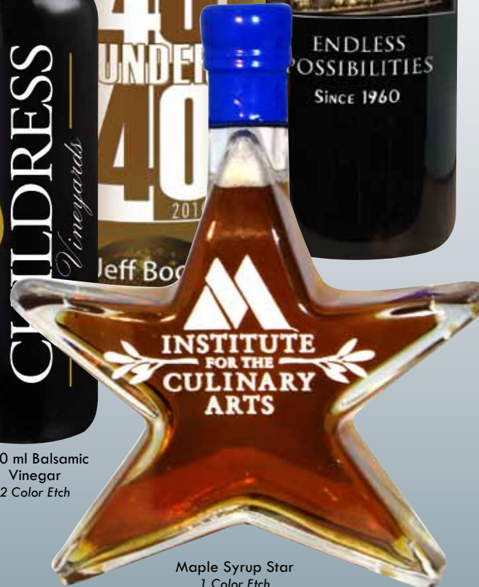
Maple Syrup Star 1 Color Etch