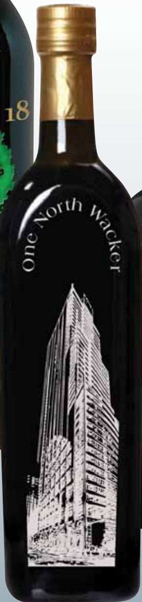
750 ml Organic Extra Virgin Olive Oil 1 Color Etch