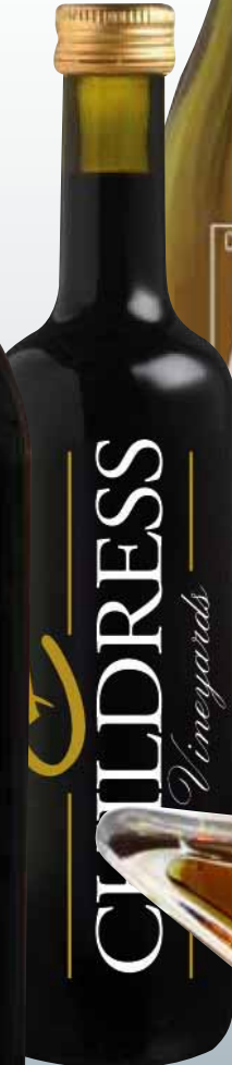
750 ml Balsamic Vinegar 2 Color Etch