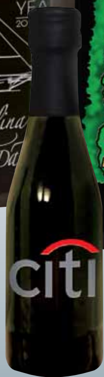
187 ml Sparkling Wine 2 Color Etch